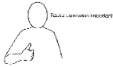
Felt Much Better (Good)